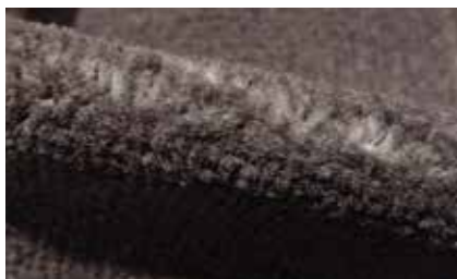
Penetration > 2 mm

NON-CONTACT FLUID APPLICATION SYSTEMS FROM WEKO